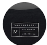
Tagless Neck Label

Now print on hoodies & a lot more with the all new standard pallets!