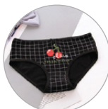
Other Specialty Items