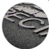
High Density Labels & Logos